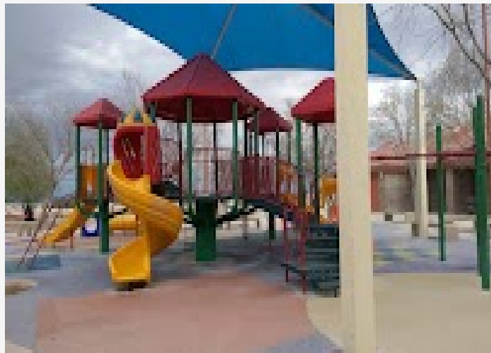
Buckskin Basin Park